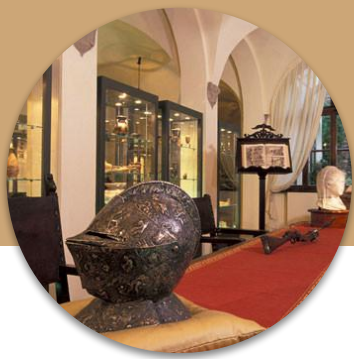
Ivan Bruschi Museum

Varied and precious collection of antiques and not, inside a historic building in the center of the city of Arezzo to discover its rich and millenary history.