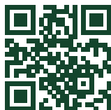
Museum of Deportation