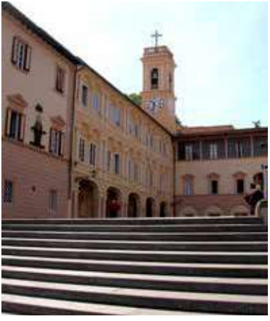
Sanctuary of the Montenero

A "dark" place, dense with woods and centuries-old trees, in ancient times it was considered unsafe, perhaps the home of brigands and bandits. From here the toponym Montenero seems to come from.