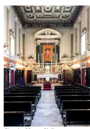
Church of Santa Giulia