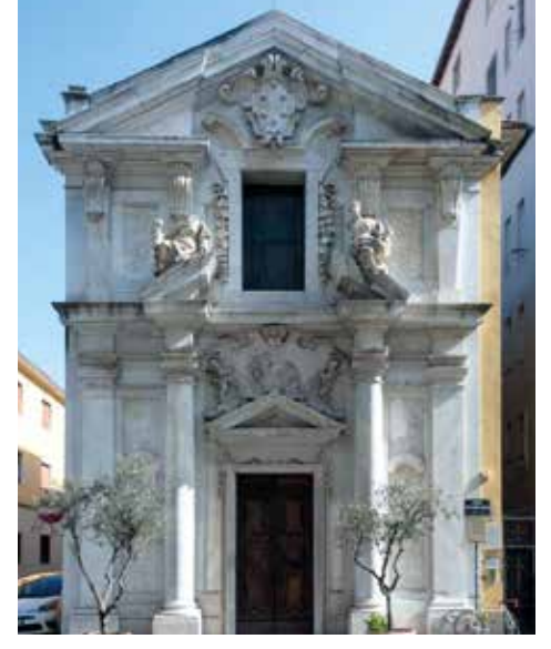
Church of the Greci Uniti

In a few minutes, beyond the market area, you arrive at a large and modern Synagogue, with a decidedly unique architecture that symbolizes the large tent that housed the Ark of the Covenant. The Synagogue is located in the same block as the 17th-century Duomo, confirming how much the Jewish community was held in great esteem by all citizens. Another visit not to be missed is the Church of Santa Giulia, consecrated to the patron saint of the city, whose story is linked to the history of the Mediterranean Sea. The small place of worship stands next to the Duomo, a short distance from Piazza