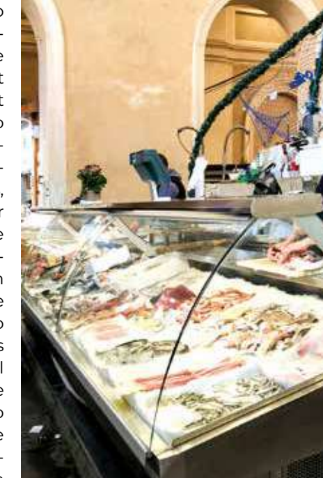
Salone del Pesce

When it was built by its architect Angelo Badaloni, in the last years of the 19th century, the "Mercato delle Vettovaglie" was one of the largest in Europe, built with the most avant-garde materials of the time: iron, cast iron and glass, to make up what the Livorno people called the "little Louvre". Its magnificence and the floral style of the metal trusses frame the friendly voices of the merchants, ready to guarantee the exclusivity of their products. The first fruits of the sea can be bought among the marble counters in the Salone del Pesce, where you can find the catch of the day at a good price, raw material for the preparation of local dishes. Visiting the Livorno market is a sensory experience: colours, scents and sounds mix, creating a unique and original emotion that stimulates the palate to taste the savoury "roschette" (like a cracker formed into rings) of the Jewish tradition, the very white eggs of the "Leghorn hen", samples of cacciucco (sort of fish soup) and the typical "ponce alla livornese" (sort of hot alcoholic drink).