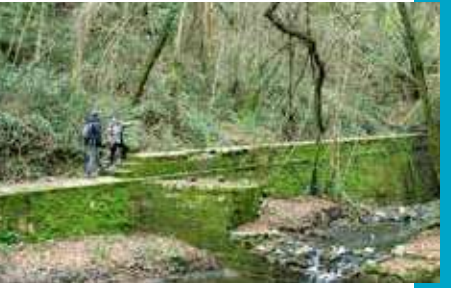
Path along the Colognole Aqueduct

The toponym is found for the first time in 1272 as "Collis Salvecti" (Colle di Salvetto) in a land sale contract, drawn up by this "notary Salvetto, son of Borgo, in Villa di Colle". With the victory of Florence, Colle became a Medici villa, a hunting lodge and the driving force of the Grand Ducal Farm - first Medici, then Lorraine - which at the time of its maximum expansion included over twenty farms.