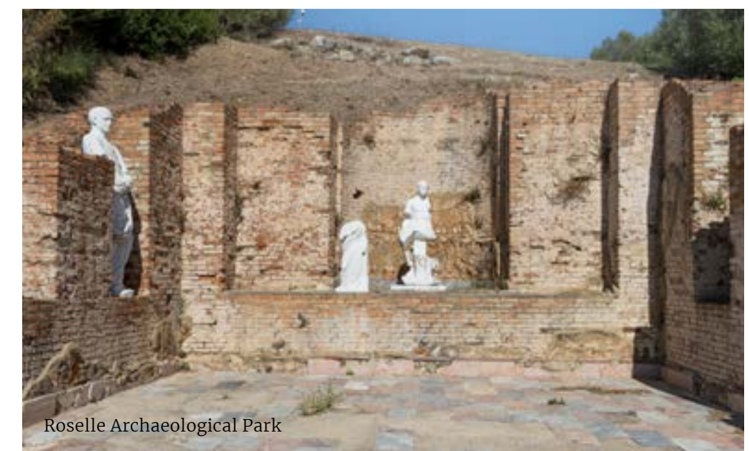
Roselle Archaeological Park

The Roman colony of Cosa was established in 273 BC, after the Romans had defeated the Etruscans of Vulci and conquered the territory. The colony is divided into three sectors, precisely two public areas and a residential one. Visitors can still stroll along the ancient streets, admiring the remains of the houses and shops of the forum. The park contains remains of buildings constructed at a later date, which is why Cosa is thought to have been a Byzantine outpost against the advancing Lombards. museidimaremma.it