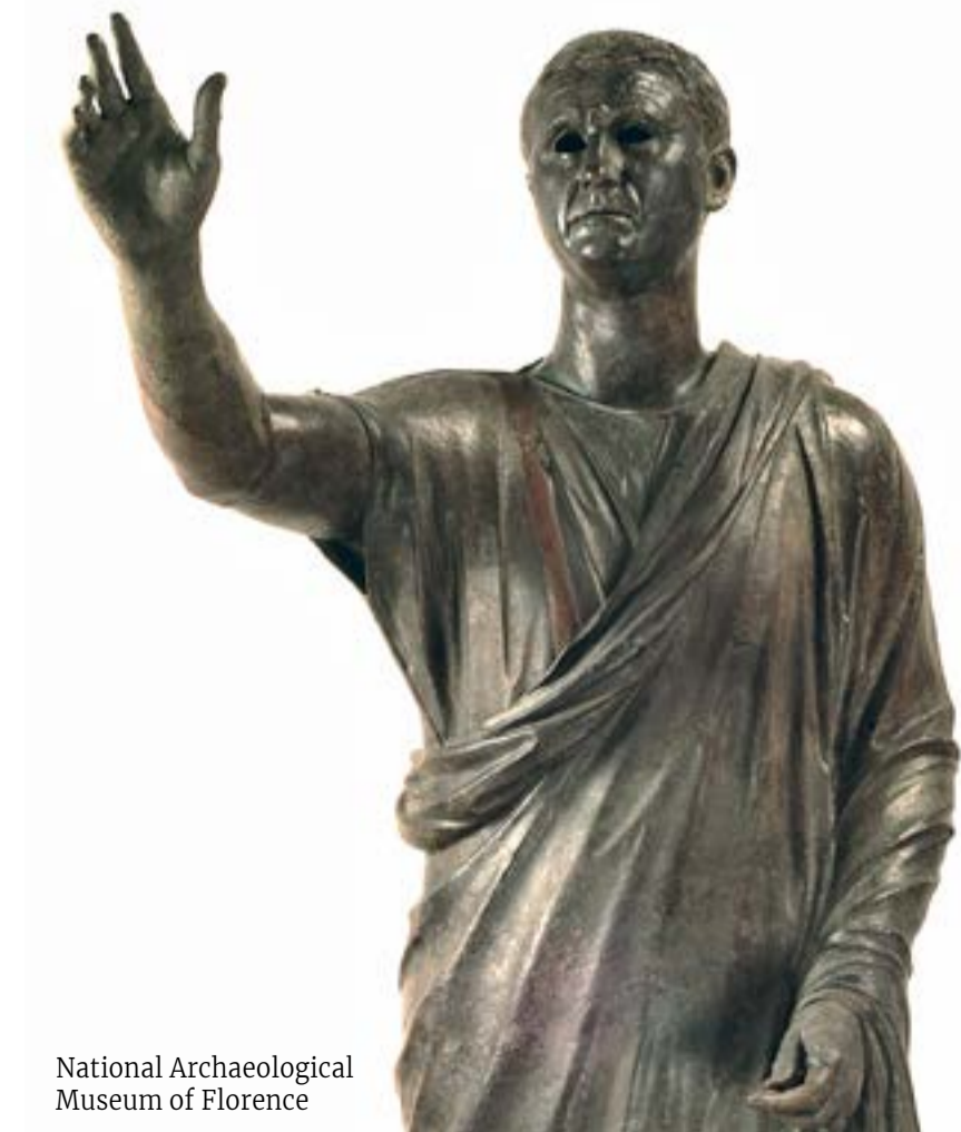
National Archaeological Museum of Florence

The Belverde Archaeological Nature Park is closely connected to the museum, and features caves formed in the travertine marble. Open for visits, they are suitably lit and equipped, such as the cave of St. Francis, the caverns of the Noce and the Poggetto. The Belverde Archaeodrome , located not far from the namesake archaeological area, is a educational itinerary that complements the visit to the Museum and Park. prehistorycetona.it