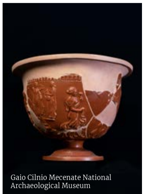
Gaio Cilnio Mecenate National Archaeological Museum

In the 1st century AD, Emperor Nero's family owned the islands of the Tuscan archipelago. Two residential villas were built on the islands of Giglio and Giannutri. The first overlooked the port of Giglio. In the 4th century AD it was used as a necropolis. The second fell into disuse in the 3rd century AD and risked disappearing, but archaeological excavations carried out in the 19th century brought it to light. It was opened to the public in 2015. museiarcipelago.it