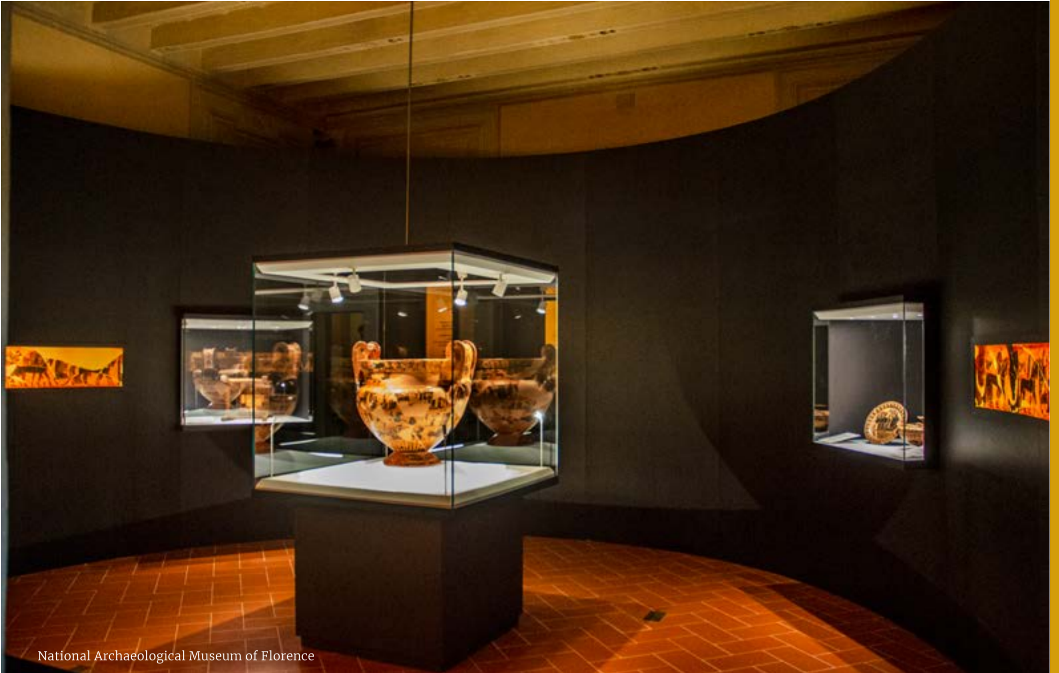
National Archaeological Museum of Florence