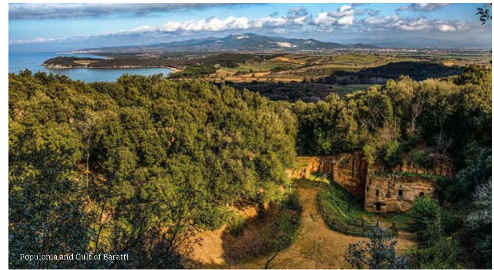
Populonia and Gulf of Baratti