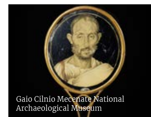
Gaio Cilnio Mecenate National Archaeological Museum

In the heart of Pisa we find Nero's baths, a Roman spa of the 1st century AD with water from the 1st century Roman aqueduct of Caldaccoli. The name might bring to mind the famous Roman emperor , but construction works on the spa began around twenty years after his death. It derives from the legend of Saint Torpé, an official of Nero's court who, after converting to Christianity, was arrested and beheaded here. The naval museum, with its beautiful collection of Roman ships, is also interesting. navidipisa.it