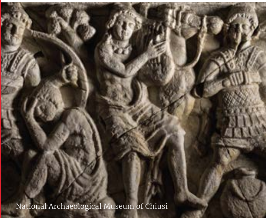
National Archaeological Museum of Chiusi

Elegant and refined, they nurtured the mind but also the body with ointments and physical exercise. Their religious practices centred on superstition became a daily practice celebrated with obsessive attention to detail. After flourishing for years, the conflict between Etruscan cities and Rome became inevitable. Hence, the 5th century BC marked the Romanisation process of Etruria . Initially painless, with the spontaneous surrender of several cities that came under the influence of the powerful neighbour, the process later became more coercive when Rome broke even the resistance of the Gauls, allied to the Etruscans, in the 1st century BC. Rome imposed its dominion in Etruscan lands, but the same cannot be said for the culture, which intrinsically presented the previous Etruscan artistic substrata and models, which were deeply rooted in the population.