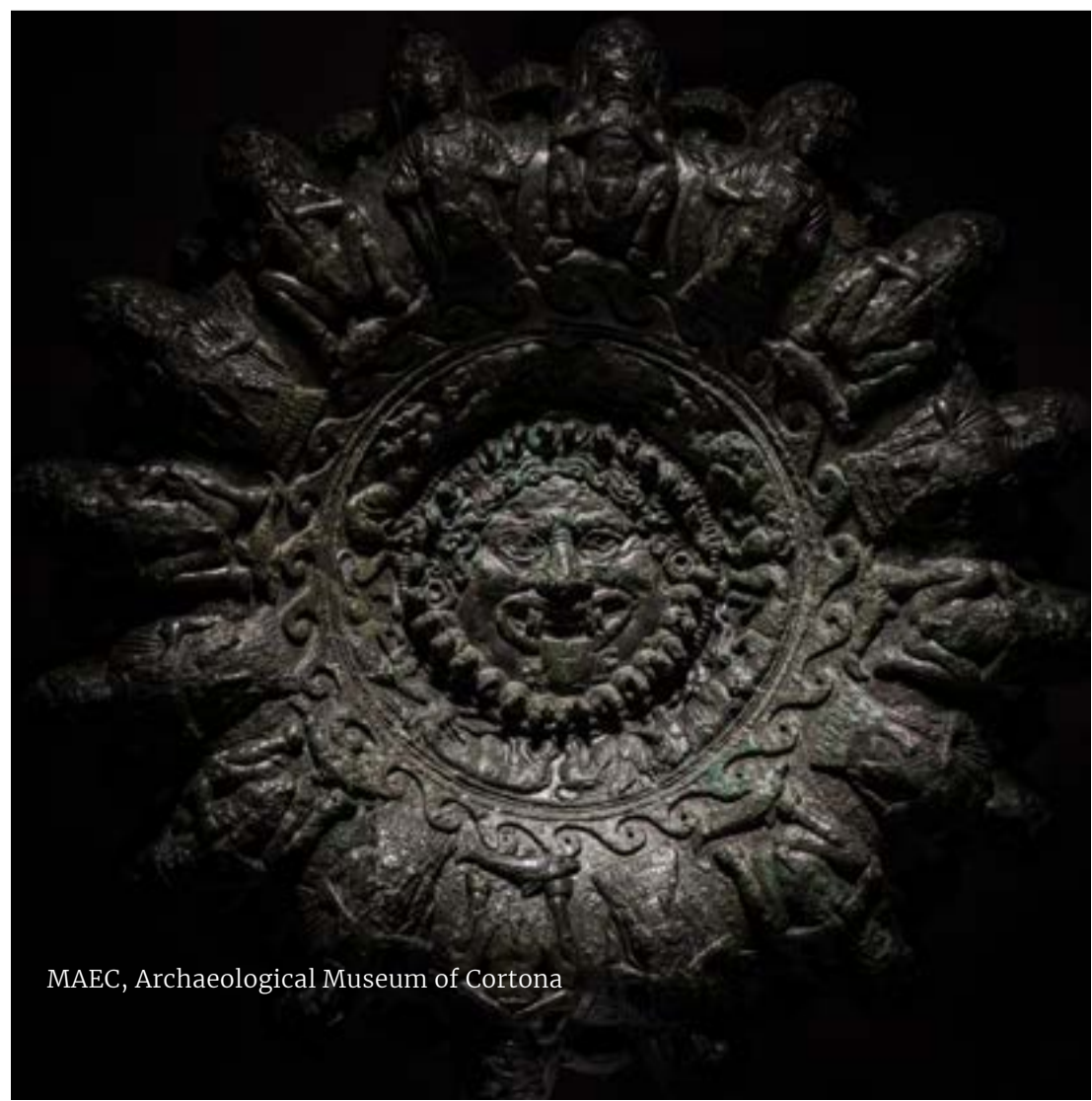
MAEC, Archaeological Museum of Cortona