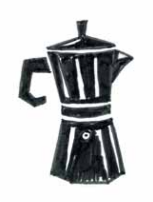
Apple's Cake Tiramisù