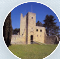
Romena Castle Pratovecchio, Stia