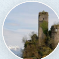
Giovagallo Castle Tresana