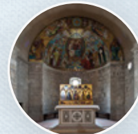
Benedictine Abbey San Godenzo