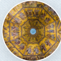
The Baptistery of San Giovanni Firenze