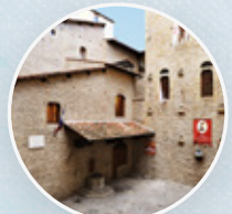
Dante House and Museum Firenze