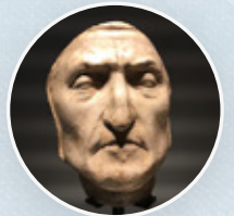
Palazzo Vecchio Firenze