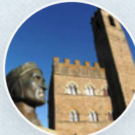
Poppi Castle Poppi