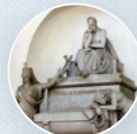
Santa Croce Church Firenze